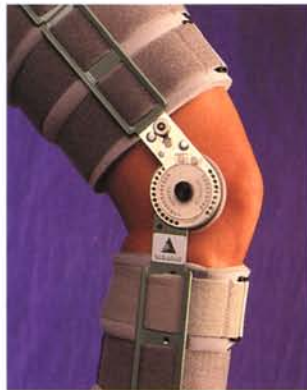
Unique Dial Locking System