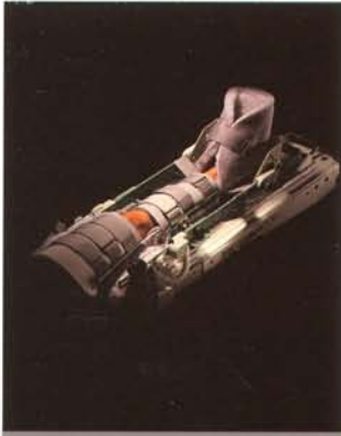
Full Knee Extension CPM Brace