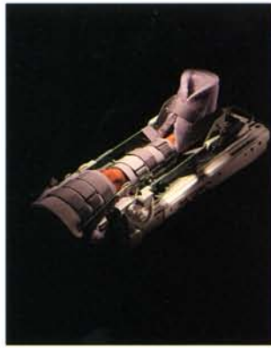
Full Knee Extension CPM Brace

"A unique "Dial Locking System" does away with cumbersome pins, screws, hex keys, tool kits or complex set-up procedures. You simply "dial-in" your desired ROM setting."