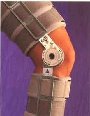
Unique Dial Locking System